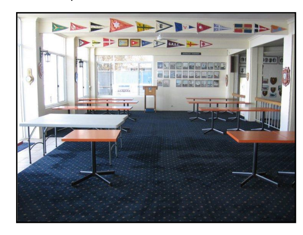
Inside the Club Rooms (top section)