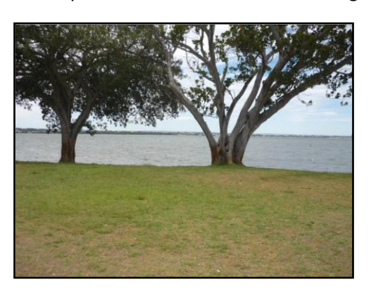
Eastern Side Rigging Area