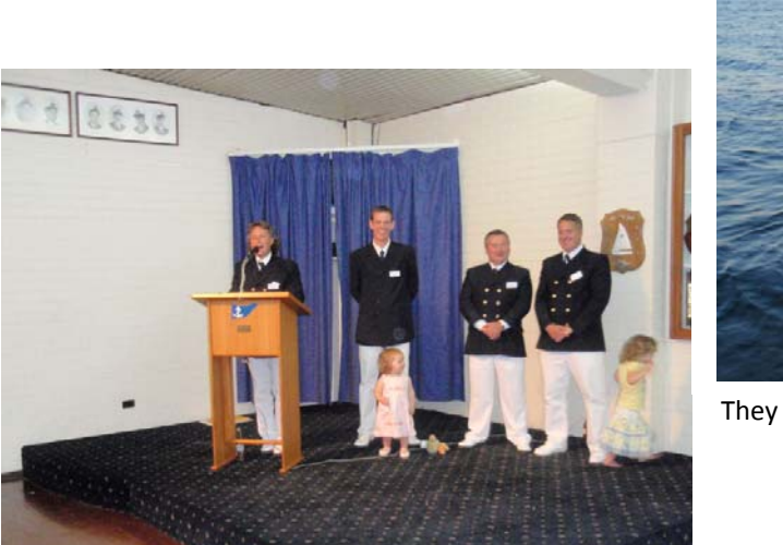
Early training for the Flag Officers of tomorrow.