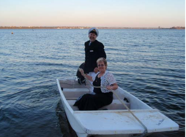
They came from far and wide in all manner of transport.