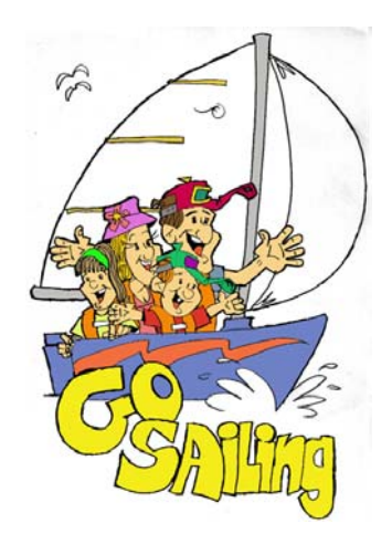
Perth Dinghy Sailing Club 7<sup>TH</sup> November 2010, 9.00am

Kym Pearce is going to be uploading photos onto the PDSC website. If you'd like your photos featured, or videos, bring them along to the club. For further information contact Kym on 0423 913 907