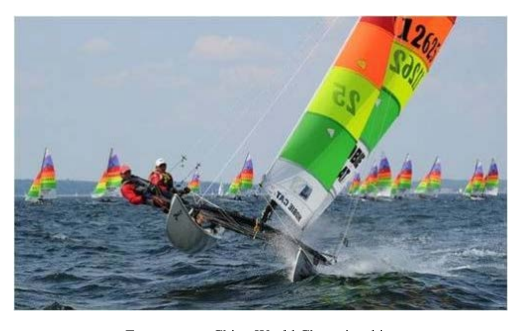
Europeans at China World Championship